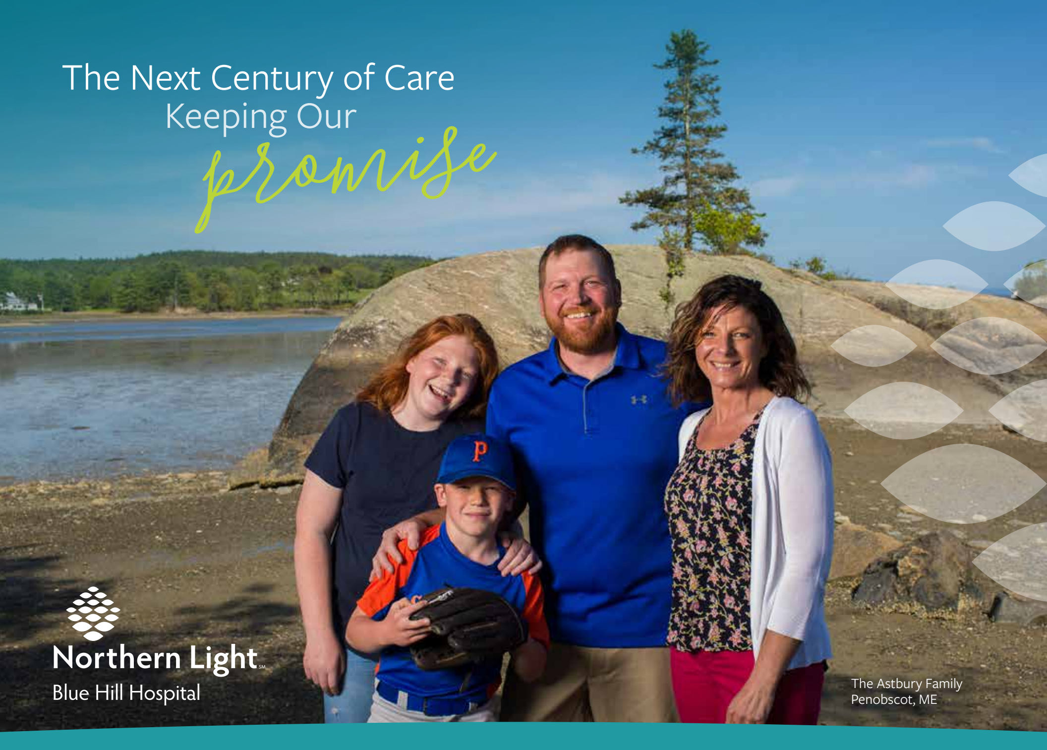
The Campaign for Blue Hill Hospital