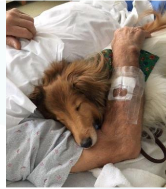
Dash, a therapy dog, owned by one of our volunteers.

The Volunteer Services Department now also serves as pathway for the development of community growth avenues for current and future employees through professional growth internship opportunities as well as sponsorship and scholarship programs.