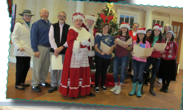
Below - Auxiliary members, friends and Bangor Area Children's Choir singers all joined Mr. and Mrs. Claus in spreading holiday cheer at Ross Manor and EMMC.

support to EMMC. The event raised a total of $418.10. Thanks to everyone who shared in the shopping fun and helped make a difference!