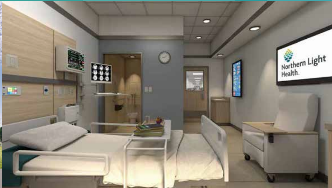
Patient room view (conceptual rendering)