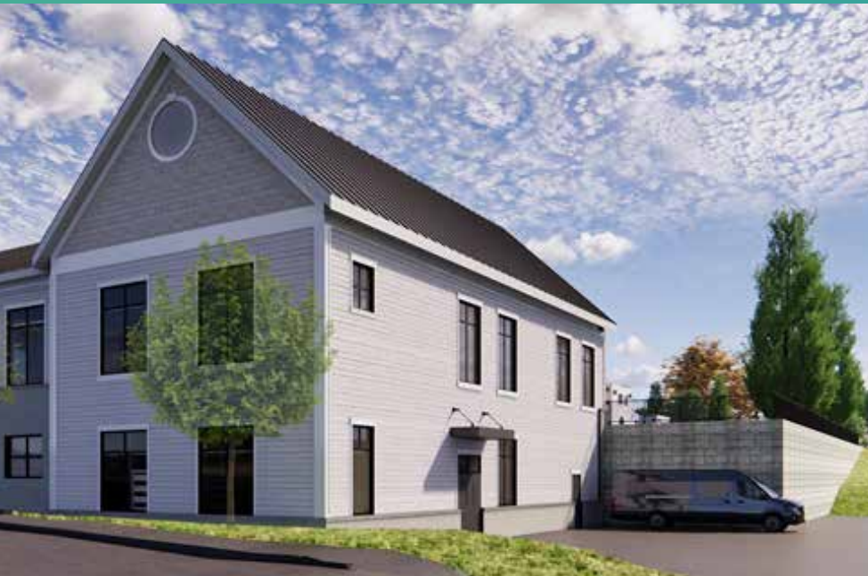
View from Water Street (conceptual rendering)